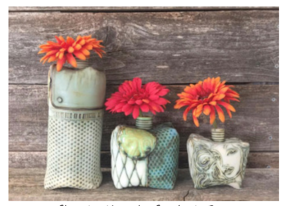
Slumping Vases by Stephanie Burton

Georgies Interactive Pigments are blends of natural mineral oxides that work in ALL firing ranges: